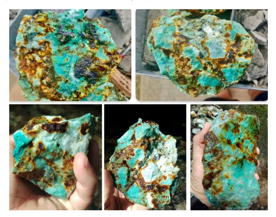
Figure 1 – Examples of in-situ copper mineralised porphyry and float located 2.3 km east of the main Cobrasco drilling area.

The field team has already located an in-situ outcrop of mineralised rock in one of several west draining creeks (the recovered samples shown below, in Figure 1).